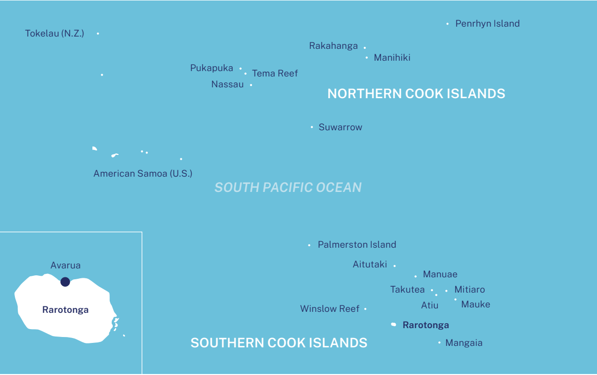
Figure 2: The Cook Islands

The total land area of the 15 islands that comprises the Cook Islands is approximately 240 km 2 and is surrounded by our 1.96 million km 2 Exclusive Economic Zone (EEZ). Our living resources within our EEZ are of great importance to our people culturally and economically for both subsistence purposes and for domestic and foreign commercial fishing. (The non-living marine resources of our EEZ and continental shelf are potentially significant sources of great wealth for our nation).