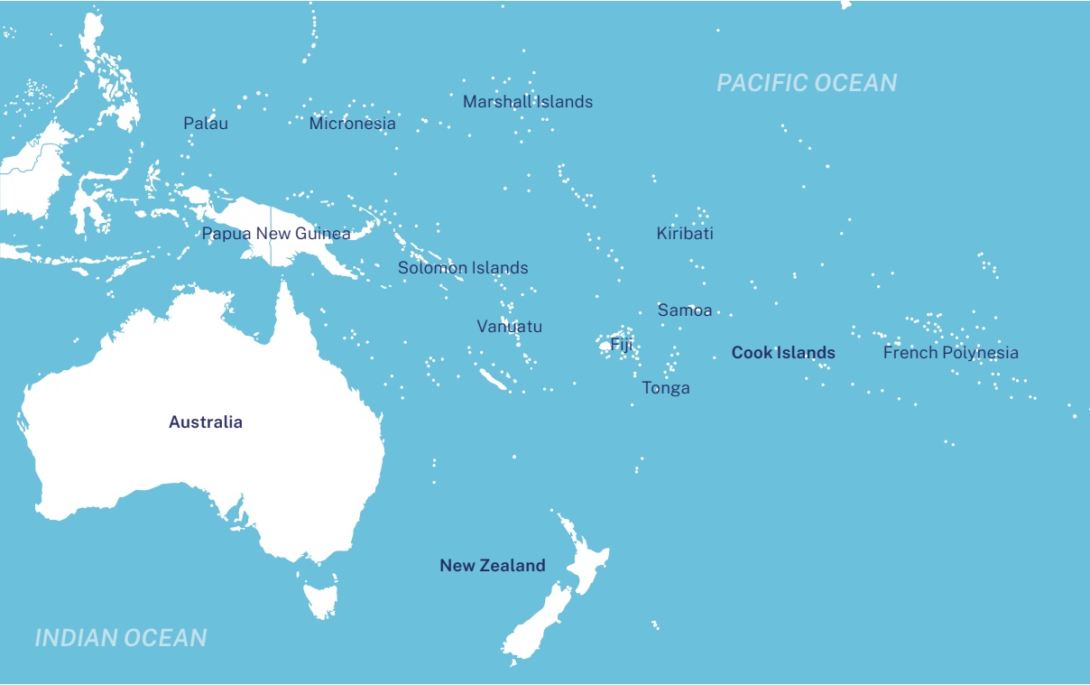
Figure 1: Location of the Cook Islands in the Pacific