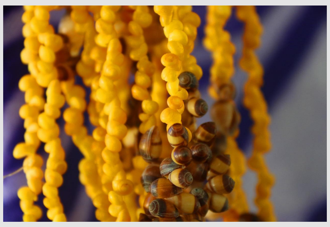
[ Ei pupu of the Cook Islands.]