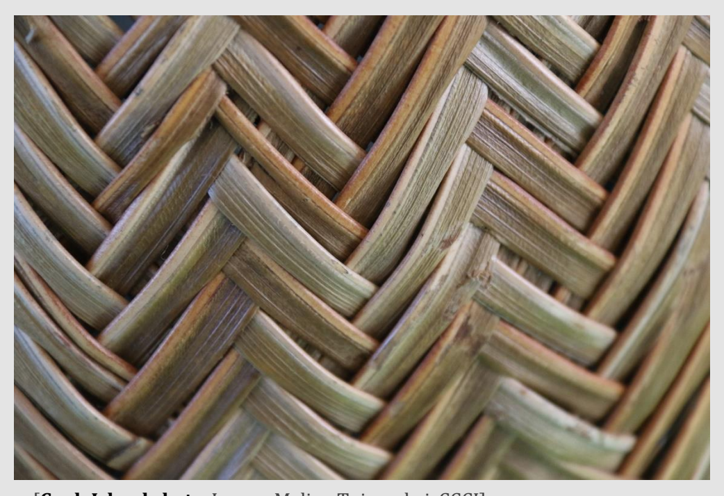
[Cook Islands kete.]