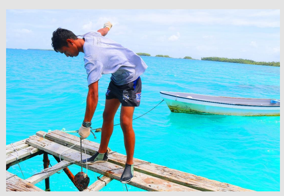
[Cook Islands pearl farmer.]

OPM supports the Prime Minister and Cabinet to ensure that the government of the day meets its obligations for sound governance of the Cook Islands. It is responsible for implementing sound processes and policy advice on the NSDP and the direction and governance of the Cook Islands. As a central agency it guides the delivery of core services by line agencies. OPM has added responsibilities for building national security and resilience to the effects of climate change, investing in sustainable energy, preparing for emergencies and managing our commitment to Marae Moana. As such, the Vision expresses the governing principle and belief to produce the best that OPM possibly can for the future of the Cook Islands: