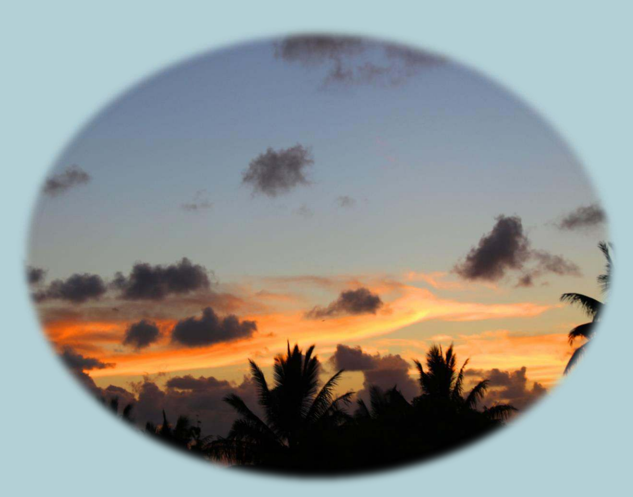
[Cook Islands skyline at dusk.]