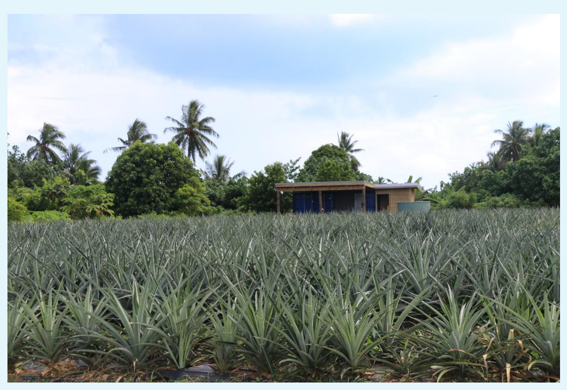
[Aitutaki pineapple plantation.]